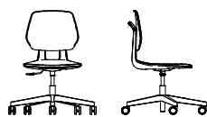
CASHY SPECIAL SWIVEL CHAIR 5A