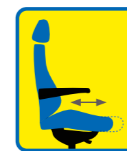
Seat Depth- setting