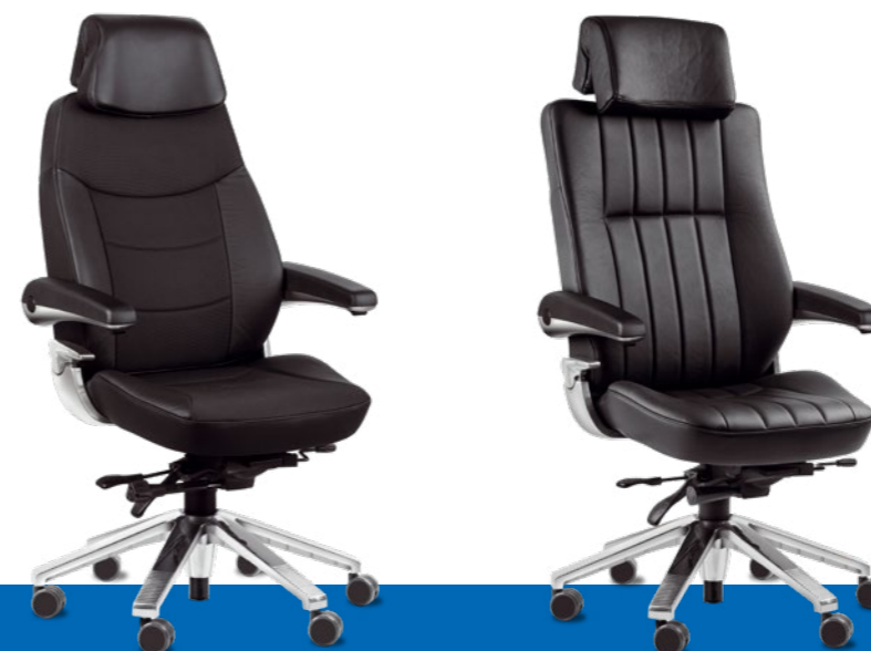
Sv S6 in black leather with comfort Headrest and tip-up armrests.

Above all, of course, the Sv S6 is all about comfortable sitting and relaxed working. Hence the reason for the Sv S5 functions and sitting comfort. Sit down and experience a totally new sitting experience. But never forget that no one will pay you the overtime.